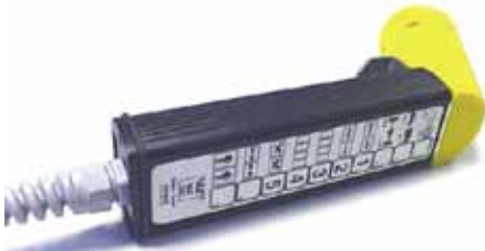
Model /CR programmed cable remote control VLT 9033/PR/CR - VLT 9036/PR/CR

With our Play Detectors for cars and light goods vehicles, we offer our customers a high quality product with all possibilities to detect in no time play and wear on vehicles.