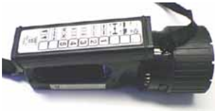
Model / RF programmed radio frequency remote control VLT 9033/PR/RF - VLT 9036/PR/RF